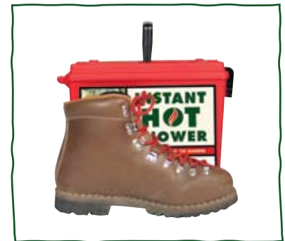
compact size, the Zodi hard case is about the size of a hiking boot